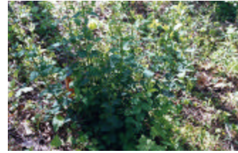
This honeysuckle bush was cut and the cut stumps were not treated with herbicide. Resprouting has resulted in a large number of stems.

Once honeysuckles have been eliminated from a natural habitat, they can usually be kept out by controlled burning. Remember, there will be a seed bank, so that small honeysuckles will appear next year. If the habitat is not burned, these small honeysuckles will grow big and you will have the same problem again. Once established, native grasses will carry a fire and help keep the honeysuckle seedlings in check.