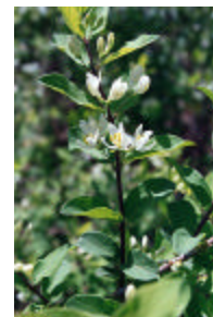
Close up of honeysuckle flowers. In southern Wisconsin, flowering occurs in late April or early May.

Honeysuckle can be cut with either a brush cutter or a hand lopper. The hand lopper works well and is suitable in volunteer work parties, because each volunteer can participate in cutting. If a stem is too large to cut with a lopper, a handsaw can be used. With a brush cutter, it is important