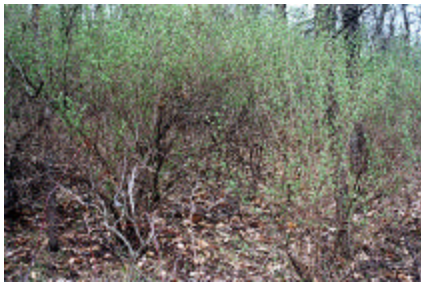
An area heavily infested with honeysuckles. In such areas, there may be dozens of such bushes covering the natural area. The shade they produce is so heavy that native forbs and grasses are unable to flourish.

Bush honeysuckles are upright shrubs ranging from a few feet to 15 feet tall. They form many branches from the base, and the spreading branches shade other plants. In a honeysuckle "thicket", almost nothing will be found under the canopy. (After