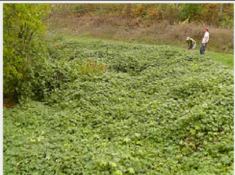
Japanese Hops blanketing a tributary to Pleasant Valley Creek