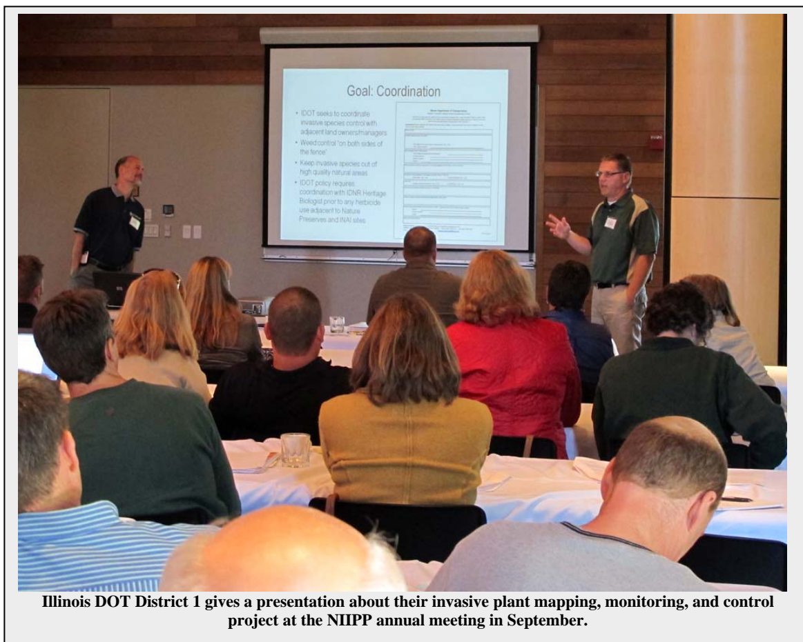
Illinois DOT District 1 gives a presentation about their invasive plant mapping, monitoring, and control project at the NIIPP annual meeting in September.