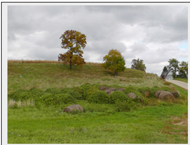
Japanese Hops covering hay bales

Recently several new populations have been discovered in small agrarian watersheds of tributaries to the Mississippi River and in the Lower Wisconsin River Watershed in northern Grant County and Crawford County. The most recent discovery is a large infestation on Pleasant Valley Creek, tributary to the Fennimore Branch of the Blue River. Evidence suggests that the hops were introduced to the watershed in hay bales transported for feed. From the bales that sit at